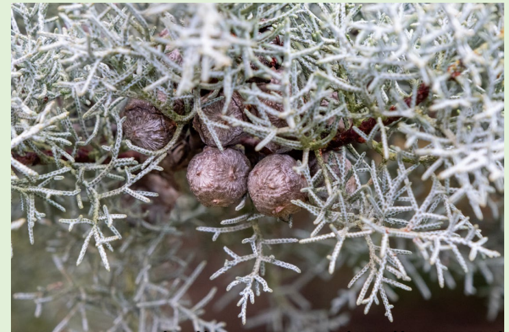
Soccer ball cones and yellow male pollen cones